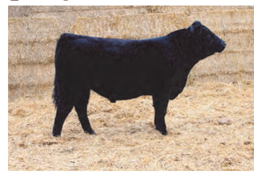
Lot 2, DLCC Belmont 25B, sold for $24,000 to Missouri Coteau Cattle Co., Crane Valley, Sask., Canada.

Lot 30, DLCC Elsa 2B, sold for $10,500 to Paul Flanagan, Hammond, NY.