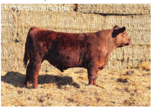
Lot 5, DLCC Battlecry 27B, sold for $23,000 to Carroll Nelson, Ryegate, MT.