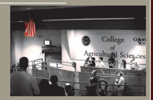
A full crowd was on hand to witness the highest bull sale average for the company to date.

353 Stabilizer Bulls - $7.040 Cattle Sold to 26 States and Canada